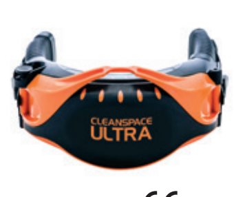
IEC 60079-0:2011 IEC 60079-11:2011 Ex ia I Ma Ex ib IIB T4 Gb 2056