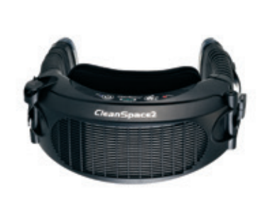
IEC 60079-0:2011 IEC 60079-11:2011 Ex ia I Ma Ex ib IIB T4 Gb 2056