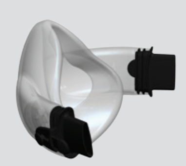
PAF-1014 Full Face*